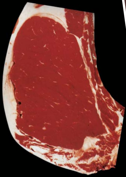
Small Marbling Minimum marbling requirement for USDA Choice